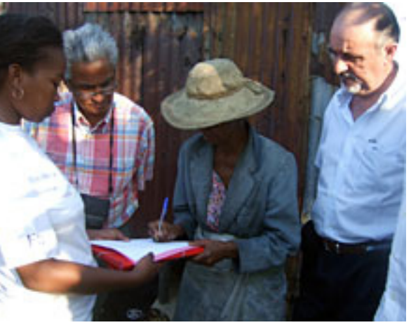
A member of the Rotary Club of Tamatave, Madagascar, signs a document on a new septic tank and water filtration system. Photo courtesy of Charles Welch

A member of the Rotary Club of Tamatave, Madagascar, signs document on a new septic tank and water filtration system. Photo courtesy of Charles Welch To improve sanitation and fight waterborne disease, Rotary clubs of the Paris-Est, Val-de-Marne, France, and Tamatave, Madagascar, are teaming up to provide more than 900 septic tanks and water filtration systems to