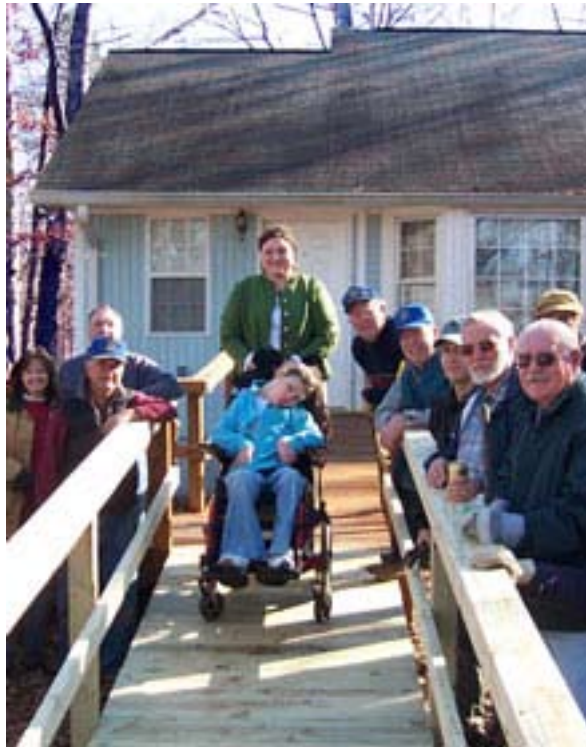
Members of the Rotary Club of Madison County, Georgia, USA, christen a new wheelchair ramp built by the club.