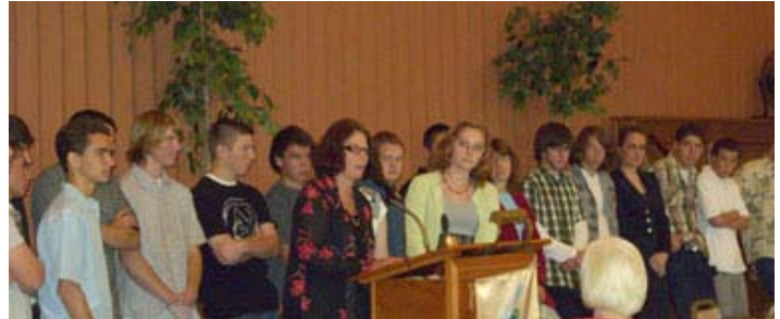
Some of our Job Shadow Students & Teachers!

For those of you who attended the Fat Tuesday Party at Main Course California, it was a lot of fun and we have booked the event for next year. don't miss it next year. We received a letter from the Friends of the Library thanking us for our donation last year that enabled the library to remain open for an additional six months. Unfortunately they were unable to secure funding to keep the library open longer but that was not to be.