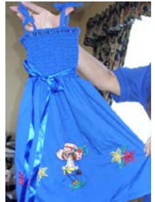
A dress made in one of the Vocational classes in Nicaragua.