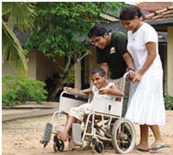
Rotaractors from District 3220 celebrate the full-moon holiday of Poya by volunteering at the nonprofit Prithipura Infants Home in Hendala, for children and young adults with disabilities.