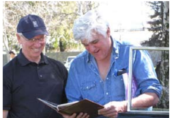
May I have your autograph Mr. Leno?