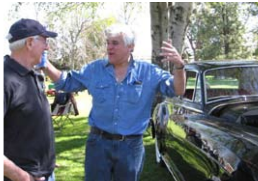
My Rolls is bigger than your Rolls!