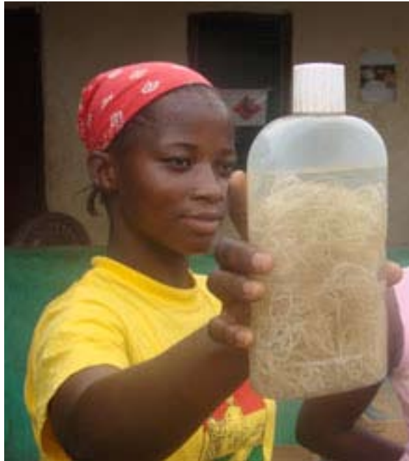
A girl in Ghana holds up a bottle containing Guinea worm.

Clubs in 13 districts in Canada, Ghana, Switzerland, and the United States have sponsored six projects funded by Rotary Foundation Matching Grants since 2005 to provide safe and clean drinking water to remote communities in northern Ghana. The Rotarians have worked with the Guinea Worm Eradication