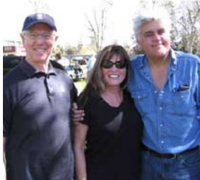
He meets Jay Leno at a British Car show!