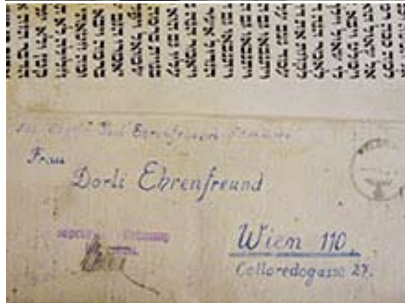
Top: Spungen at the Illinois Holocaust Museum and Education Center, where he volunteers. Bottom: The fragment of scripture that a soldier used to wrap a package.