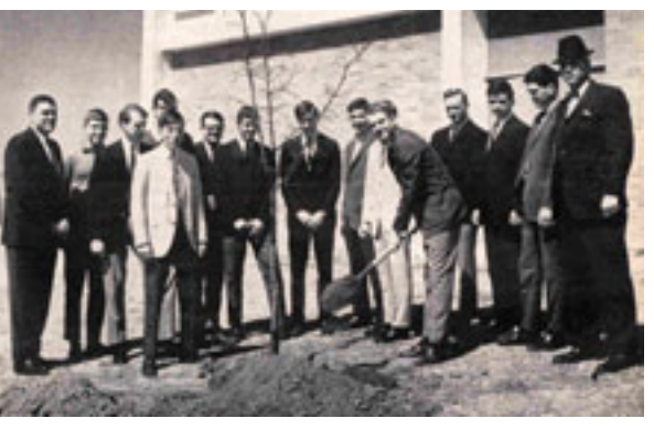
In March 1968, the Rotaract Club of University of North Carolina-Charlotte, USA, planted a tree on its campus to commemorate receiving the first Rotaract charter.

In the late 1960s, noting the success of the recently formed Interact program, the RI Board realized the need for a program of service, activity, and fellowship for young adults no longer of Interact age (14-18). The name Rotaract (Rotary in Action) was selected to show the program's close affiliation with both Rotary and Interact clubs.