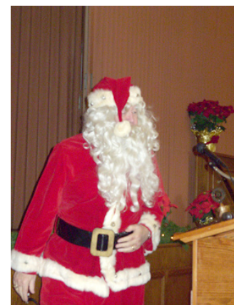
Santa paid us a visit today!