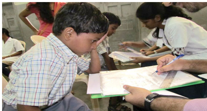
A student's vision is tested during one of the health camps in Mumbai. The project screened 10,000 students.

Rotaractors in Mumbai, India, most of them medical doctors, are providing vision screenings and comprehensive eye care to thousands of schoolchildren in poor neighborhoods of the city, through a series of medical camps aimed at improving the children's performance in school.