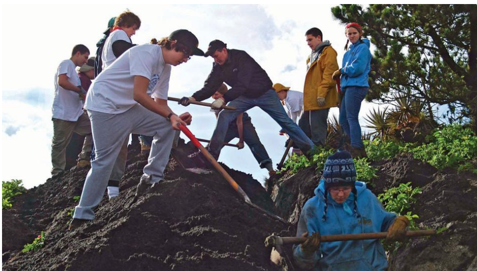
High school students from the Builders Beyond Borders program help install pipes that will carry water to the mountain town.

Perched in the rugged mountains of central Ecuador, the village of Tingo Pucará seems an unlikely place for artistic inspiration to strike. But Tony Riggio never leaves his camera behind—and his photos of Tingo Pucará illustrate what can happen when Rotary members and young people team up on a water project.