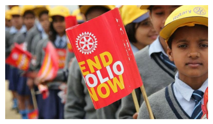
Schoolchildren participate in a rally organized by Rotary members in Ghaziabad, Uttar Pradesh, India, celebrating the country's achievement of polio eradication.

The World Health Organization certified on 27 March its 11-country Southeast Asia region has eradicated polio, a long-awaited declaration given that five years ago India represented nearly half of all polio cases worldwide. The region's last wild polio case was reported in West Bengal, India, on 13 January 2011.