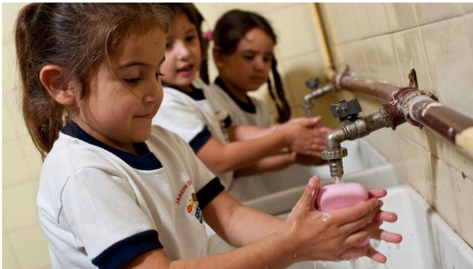
This year's World Water Summit focused on water, sanitation, and hygiene in schools.

Almost 200 million days of school attendance are lost every year because of the lack of proper sanitation. Many diarrhea cases in children result from transmission of disease in schools rather than at home.