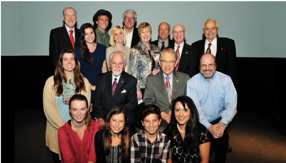
The Don't Wait Vaccinate Committee in District 5340 (California) has been meeting monthly since 1994.