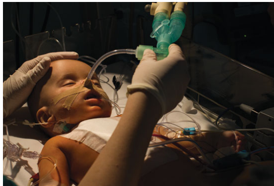
The average age of patients who receive surgery is one year old, but sometimes doctors operate on infants in the first days of life.