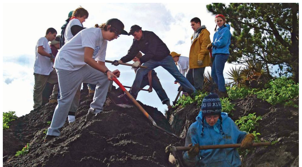
High school students from the Builders Beyond Borders program help install pipes that will carry water to the mountain town.

Perched in the rugged mountains of central Ecuador, the village of Tingo Pucará seems an unlikely place for artistic inspiration to strike. But Tony Riggio never leaves his camera behind—and his photos of Tingo Pucará illustrate what can happen when Rotary members and young people team up on a water project.