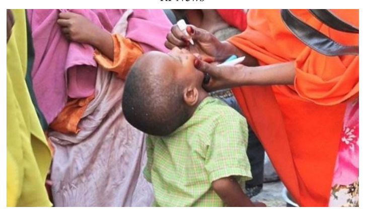
A child receives the oral polio vaccine during an immunization campaign. As of 14 August, 110 cases of wild poliovirus have been reported in the Horn of Africa.

Rotary has approved a $500,000 Rapid Response grant to the World Health Organization (WHO) to address a recent polio outbreak in Somalia. The outbreak occurred in the Banadir region of Somalia, where a large number of children had not been vaccinated against polio due to inaccessibility.