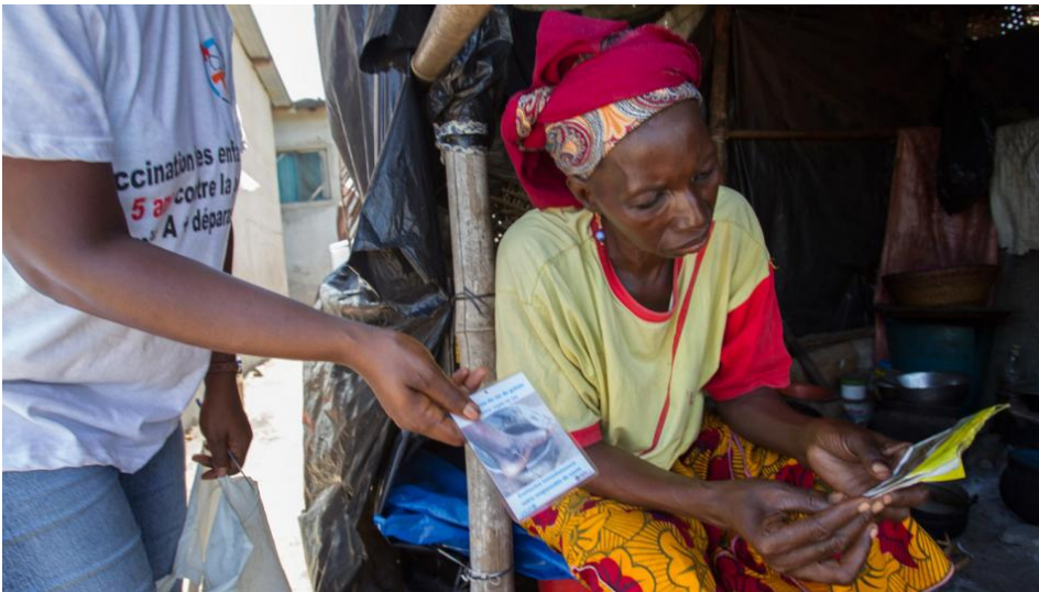
Volunteers show a woman in Azuretti a pamphlet on polio and de-worming, part of the public awareness campaign to boost participation.

It's been more than two years since the last polio case was reported in Côte d'Ivoire. Time enough for people to become complacent about immunizations. But that would be a mistake – a potentially deadly mistake.