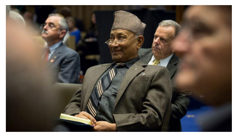
Attendees at Water Summit at Sydney learn how to create partnerships with the private sector, nongovernmental organizations, and governments to deliver clean water and improved sanitation facilities in all the world.