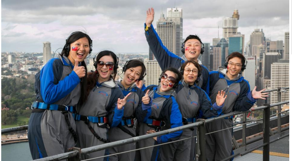
During Friday's world record-breaking Sydney Harbour bridge climb, Rotary members raised enough money to protect 240,000 kids from polio.

Polio took a hit at this year's Rotary convention in Sydney, Australia. First there was the record-breaking climb across the Sydney Harbour Bridge that raised enough money to protect 240,000 kids from polio. On 30 May, two days before the official opening of the convention, 340 participants ascended the bridge, eclipsing the record previously held by Oprah Winfrey for most climbers on the bridge. Waving 278 flags, they also broke the Guinness World Record for most flags flown on a bridge.