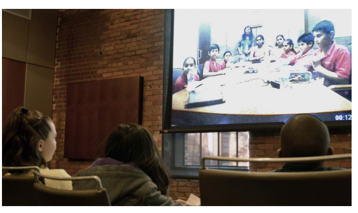
A group of 6th grade students from YE Smith Elementary in Durham, North Carolina, USA, talk with students in Ahmedabad, India, as part of the Rotary Reading Rangers literacy program.

A group of elementary school students smile and laugh, asking each other questions and sharing stories. Their conversations turn to recess, their pets, favorite sports, and what they like to eat. It may sound like a typical classroom setting, but half of the students in the room are in Durham, North Carolina, in the U.S. and the other half are on the opposite side of the globe in Ahmedabad, India.