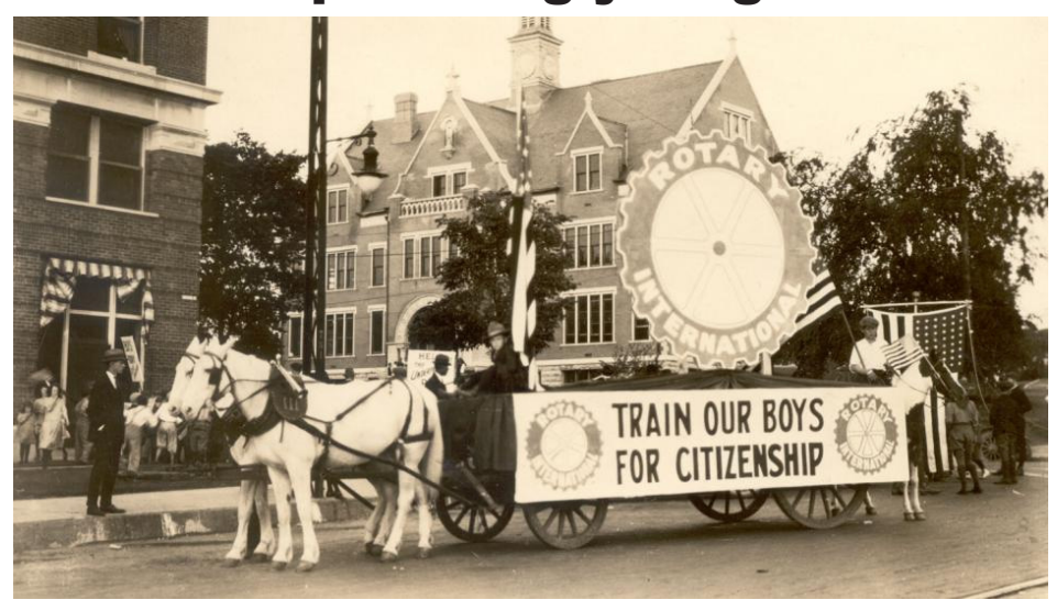
The Rotary Club of Fort Smith, Arkansas, USA, sponsored a float in a 1924 Loyalty Day parade.

The history of Rotary's work with youth dates back to the 1920s, when many clubs took part in an international event known as Boys' Week.