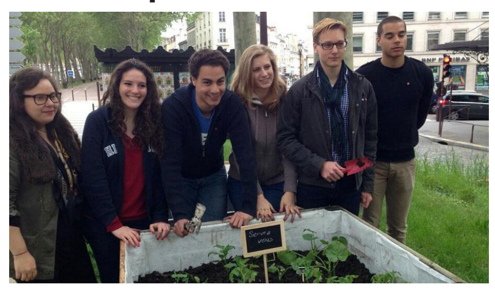
Versailles Rotaractors and friends launch a Potalib project in Vélizy-Villacoublay.

Imagine a community where the residents are all free to plant, grow, harvest, and eat healthy food whenever they want without having to pay for it.